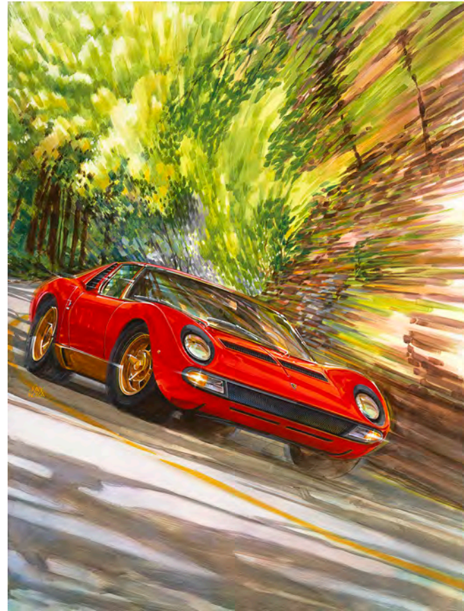
"The Drift No 4" - "Le 'Drift' No 4" Jay Koka ©2018, 34x44" (85x110cm) acrylic on canvas

The Drift No 4 continues a series of paintings started in 2000. Its predecessors have featured a Jaguar XKD, a Porsche Carrera GT (2008) and a Porsche 918 (2016) each as different in style and execution as the one before.